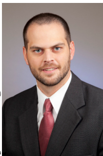
Trust Accounting Manager