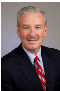
Regional Vice President, East