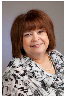
Administrative Assistant & Assistant Corporate Secretary