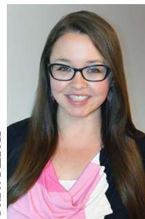
Ministry Support Coordinator

You can reach MBF by calling 800-776-0747 or emailing at foundation@mbfn.org . You can also follow MBF on Facebook.