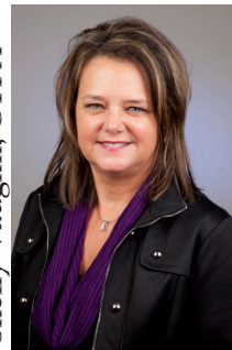
Vice President for Trust Administration